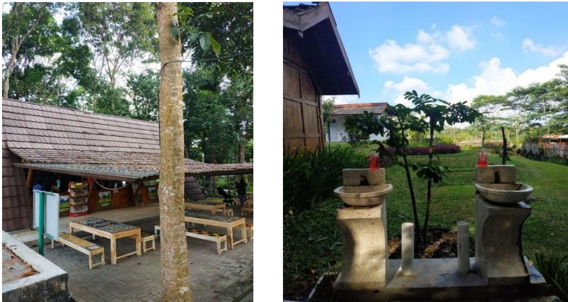
Figure 1. Bhumi Merapi agrotourism

With the historical story of Bhumi Merapi Agrotourism, the management hopes that the company will continue to grow, present new rides and of course make the company a leader in the available markets.