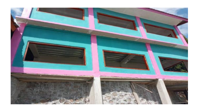
Figure 3. Café and Homestay Building

In the beginning, Riang Tanah Tiwa Cultural Studio only performed in the courtyard of the head of the studio, then after many tourists visited, the studio started to build homestays, canteens, toilet culture houses and hand washing facilities. In 2021, Riang Tanah Tiwa Cultural Center is constructing a building which is planned to be used as a homestay and café.