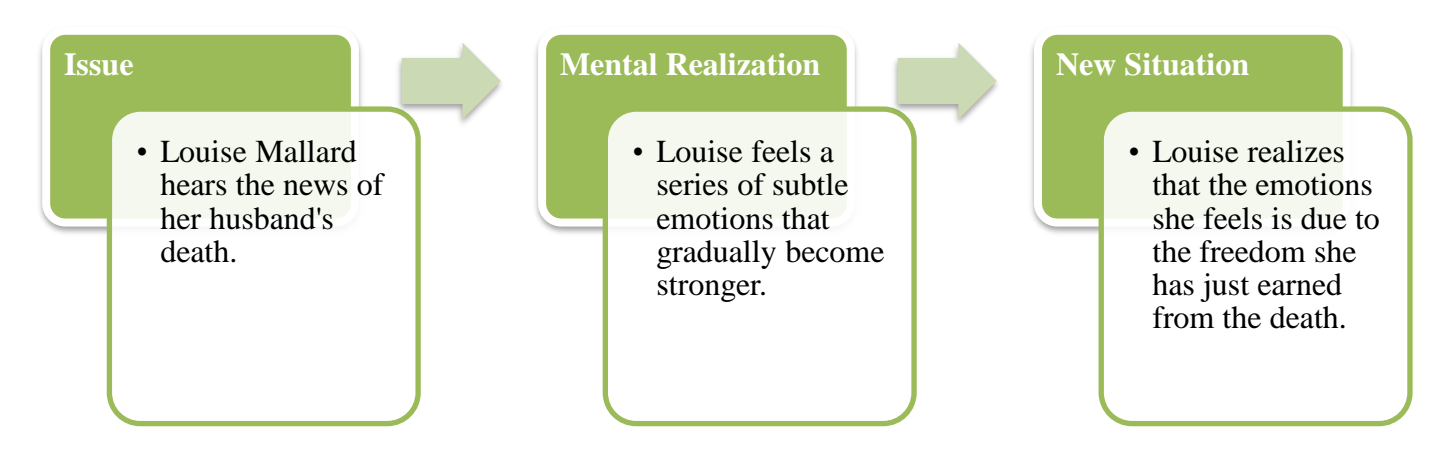
Figure 2 Visualization of Louise Mallard's agency process in The Story of an Hour

Louise's agency process can be illustrated in the diagram below. Notice how the diagram differs from Nora's. What is formed after the mental realization is not decision-making, but a new situation is created. Also, her mental realization is in the form of abstract emotions while Nora's mental realization is a conclusion that she draws from an issue. This will be explained further in the next section.