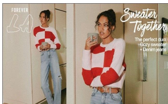
Picture 3. Fowever 21 Brand