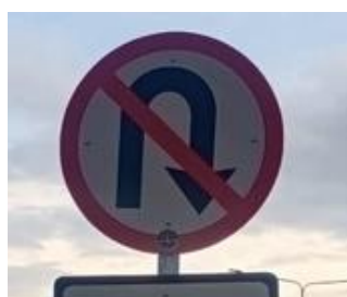
Figure 7 Jl. Imam Bonjol

This sign was categorized as a restriction due to the red background. Based on Department for transport (2007) said red background is a restriction sign. The black color symbol means turn back direction. Entirely, the symbol means no turning around their cars or other forms of transportation.