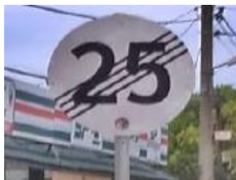
Figure 11 Jl.Pulau Batam

This sign was categorized as information due to the white background. Based on Department for transport (2007) said white background is an information sign. The black color symbol of the number 25 means speed limit. Entirely, the symbol means to tell every driver to pass that way at 25km/hour.