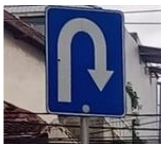
Figure 10 Jl.Teuku Umar

This sign was categorized as direction due to the blue background. Based on Department for transport (2007) said blue background is a direction sign. The white color symbol means turning back direction. Entirely, the symbol means to tell road users that this way can do turning back.