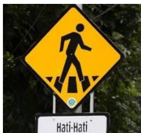
Figure 3 Jl.Imam Bonjol

This sign was categorized as a warning due to the yellow background. Based on Department for transport (2007) said yellow background is a warning sign. The black color on the man's symbol means a pedestrian crossing sign. Entirely, the symbol means a warning sign used to urge drivers to be cautious when traveling through the region, because someone is crossing a zebra.