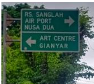
Figure 8 Jl.Hasanuddin

This sign was categorized as direction due to the green background. Based on Department for transport (2007) said blue background is a direction sign. The white color symbol means a region direction sign. Entirely, the symbol means to tell drivers about the location and directions to these sites, Each name mentioned the direction of the place. There are names from that symbol: in the right direction is RS. Sanglah, AirPort, and Nusa Dua, for the left direction, is Art Centre Gianyar.