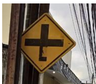
Figure 4 Jl.Imam Bonjol

This sign was categorized as a warning due to the yellow background. Based on Department for transport (2007) said yellow background is a warning sign. The black color like the plus symbol means crossroad. Entirely, the symbol means a warning sign that informs drivers that the next crossroad is approaching.