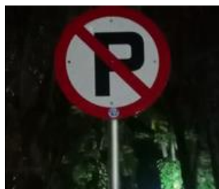
Figure 5 Jl. Diponegoro

This sign was categorized as a restriction due to the red background. Based on Department for transport (2007) said red background is a restriction sign. The black color symbol “P” means parking. Entirely, the symbol means to tell road users not to park their vehicles until a distance of 15 m from the place, these signs are installed based on the traffic direction.