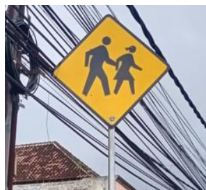
Figure 2 Jl.Imam Bonjol

This sign was categorized as a warning due to the yellow background. Based on Department for transport (2007) said yellow background is a warning sign. The black color on the kids' symbol means many children. Entirely, the symbol means a warning sign instructing motorists to use caution since there are a lot of youngsters in the vicinity in order to prevent accidents.