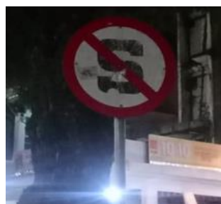
Figure 6 Jl. Diponegoro

This sign was categorized as a restriction due to the red background. Based on Department for transport (2007) said red background is a restriction sign. The black color symbol “S” means stop. Entirely, the symbol means to tell road users not to stop their vehicles until a distance of 15 meters, although in second and any condition and situation.