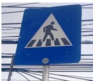
Figure 9 Jl.Imam Bonjol

This sign was categorized as direction due to the blue background. Based on Department for transport (2007) said blue background is a direction sign. The black color symbol on the man means crossing location. Entirely, the symbol means for pedestrians prepared to cross the road.