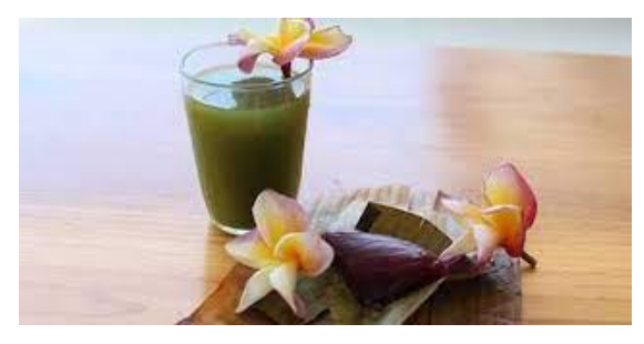
Picture5<u>https://asset.kompas.com/crops/jLDMuZh3eWb</u> oY5Iv9phZ-HrIdIM=/0x0:470x313/780x390/data/ photo/2021/08/11/61139816bce20.jpg</u> - Loloh Cemcem

In addition to the natural beauty and culture in this village, it turns out that this village also has culinary delights that are very appetizing and become an attraction for tourists who come. "Loloh cemcem and Tipat Cantok" is a typical Balinese cuisine available in this village. "Loloh Cemcem" is a special drink made from cemcem leaves or cloning leaves which are made traditionally and without preservatives or artificial sweeteners. This drink is efficacious for digestion. "Tipat Cantok" is a typical Balinese ketupat served with boiled vegetables and doused with peanut sauce.