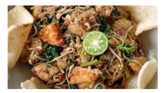
Picture4https://www.hargatiket.net/wpcontent/uploads/2019/12/wisata-kuliner.jpg -Tipat Cantok