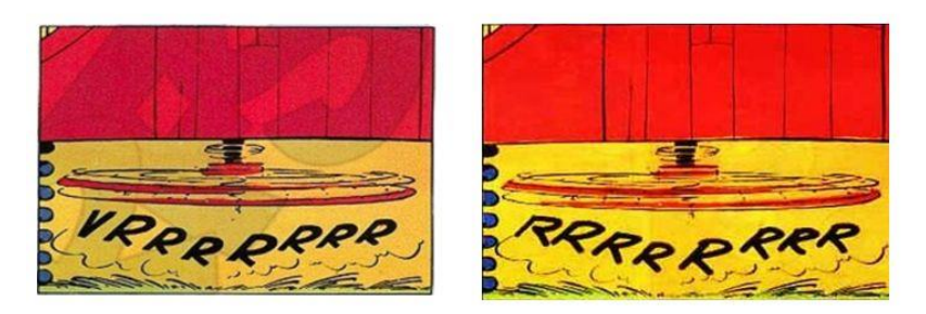
Figure 1: A panel from page 11 of Astro Smurfs' Rocket Machine (Astro Smurfs, 1970)

Onomatopoeias are often found in comics. In translating comic series, the translator is expected to master more than just the language but also the culture to know whether it is appropriate to read and acceptable to the readers. As an illustration, the following figure demonstrates an onomatopoeic sound in a Smurf comic: