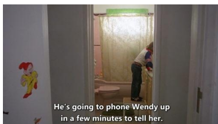
Figure 2. A Conversation between Danny and Tony about Wendy

Danny belongs to Indigo because he has some characteristic of Indigo. One of them is precognition or the ability to know the events that will occur in the future or has not happened. The following figure show Danny with his precognition ability when he asks to Tony, his imaginary friend about Jack's chance of getting a job. In the scene, although Danny's voice is changing but we do not see it clearly as the angle of the camera only shows the body of Danny. Tony answers it by saying that his father in a few minutes will phone Wendy up. The next scene, it shows Wendy in the kitchen until the phone is ringing. The caller is Jack who tells Wendy that he got the job.