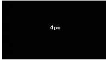
Figure 14. The time which is as the main part of the film