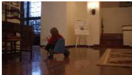
Figure 25. The Reflection of Tony on the Floor

for what's next. And then suddenly Danny stops his tricycle after the corner. The camera also stopping his move and from the shot of Danny's shoulder we can show there is the twins standing in front of him and then the camera is changing to close up of Danny which is showing his shocking face, not blinking and breathing heavily. The camera moves back to the perspective shot as the girls begin to speak. This following scene can be symbolized as the mind mapping of Tony to Danny that there is an event that Danny should see and it is the dead of the twins. The hallway scenes can be related to Danny's characterization as an Indigo which can see the past.