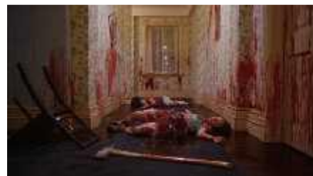
Figure 23&24. The Twins and the scene which shows the vision of Danny