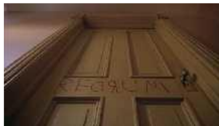
Figure 22. The Redrum

It is the part of the vision from Tony. The first appearance happens after Danny entered the room 237. When Jack had just come back from room 237 and Wendy suggests that they should leave the hotel. Danny is showing in shock condition, the camera is moving to close up slowly. Then, there is jump-cut editing from Danny to the redrum door and then back again to Danny. After that, the scene shows to Jack which is continue to the lift of blood scene. It can be symbolized as there will be a murder from Jack Torrance. The second appearance of the redrum door is happen after Danny was controlled by Tony. Then, Wendy is trying to talk to Jack about leaving the hotel. In this scene, there is cross-cut editing which is showing Danny in his room with his shocking expression and there is a voice of Jack as the background of it. Then it follows with the lift of blood scene and red-rum door which is using jump-cut editing. It can be symbolized that Jack has a target of his murder which is Danny. The last appearance is happen when Danny which is controlled by Tony is writing a word redrum in the door. This is the realization of the vision of Tony to the audience. When Danny is writing the words redrum, there is a shadow in the door. The using of this technique of lighting can be told that the shadow is Danny and the one who writes is Tony. Redrum door in this film is relating to the character of Danny, which is indigo. The following figure shows the Redrum: