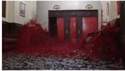
Figure 21. The Lift of Blood