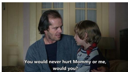
Figure 4. Jack asked Dany about the hotel

Danny also belongs to smart person as the one whom quick to understand. The following figures show about Danny, wants to take his toy in the bedroom. When he comes into the bedroom, he sees Jack in the terrible condition. Jack calls Danny to accompany him for a while. Jack asks Danny about the hotel until Jack says his intention to stay in the hotel forever. This statement reminds Danny of the twin before and Danny realizes something so he asks if Jack will kill him and Wendy or not.