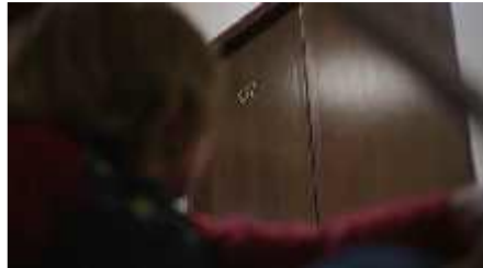
Figure 11&12. Room 237 as the main place of the main problem

clairvoyant and also in this place shows the external conflict between Danny and the woman in the room 237.