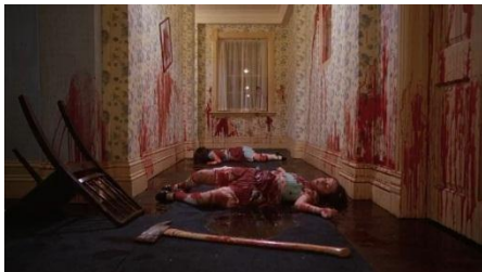
Figure 19. Axe

From the following figure 3, it can be seen that there are the corpses of the twins and there is an axe on the floor which can be assumed that the axe used to kill them.