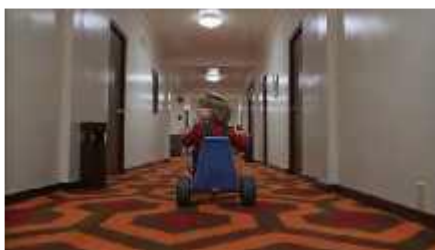
Figure 16. The Tri-cycle

The icon of tricycle shows Danny who has an indigo characteristic can feel something wrong in the hotel. When he stops at the first time on the front of the room 237, Tony warns Danny not to enter the room. When he meets the twins, the twins actually want to show him about what is really happen at the hotel. So that it indicates with his character.