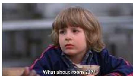
Figure 3. Danny is able to read people's mind

When indigo children meet with another indigo, they can use telepathic as a communication between them. Telepathy is a way of communicating thoughts directly from one person's mind to another person's mind without using words or signals. Dick Halloran is using telepathy towards Danny when they are in the food storage. Dick asks Danny if he wants some ice cream although Dick is still explaining to Wendy about the food in it. The scoring of the film also support it, suddenly the conversation is fade away and it replace with the echoes sound.