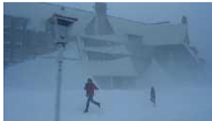
Figure 15. The winter season

The setting of time in this film takes place in winter season. From the middle of this film, it shows the season of this film is winter.