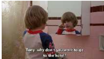
Figure 18. Mirror

Mirror becomes icon for it relates to the Danny's character as an Indigo. This mirror also the thing that prevents Jack's Torrance can kill Wendy and Danny.