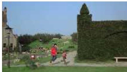
Figure 13. The Overlook Maze

In this place Danny shows his character which is smart person and also this place shows the external conflict between Danny and Jack Torrance.