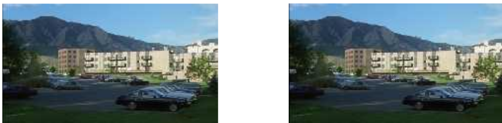
Figure 9&10. Apartment, a place where Danny lives with his parents

This is the home of Torrance family before they are going to The Overlook Hotel. The view of the apartment can be seen in the figure 22a. In this apartment, Danny feels difficult to find a friend.