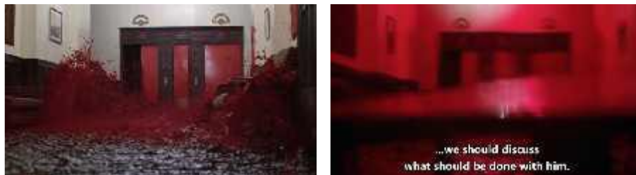
Figure 26&27. The Lift of Blood, there will be a murder

The relation between the lift of blood and Tony's vision is that it will be shown the audience as the sign that there will be a murderous scene. The index of Lift of blood in this film relates to the character of Danny as an indigo for the precognition ability and also the trigger of the external conflict experienced by Danny against Jack Torrance. The following figure shows the lift of blood: