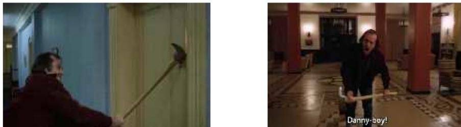
Figure 7&8. Jack chases him until the Overlook Maze.

After a several months living under isolation in the Overlook Hotel, Jack slowly became a hotheaded person again. When Danny accidentally entered the room 237 and he appears with torn sweater and bruised neck, Wendy accuses Jack as the suspect. From here Jack sees Danny as the one who should be corrected. The conflict between Jack Torrance makes the vision from Tony become real that in the Overlook Hotel about a murder. The following figure shows the external conflict between Danny and Jack Torrance: