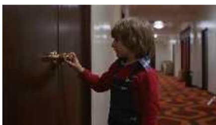
Figure 6. Danny became curious about room 237

Danny becomes so curious about room 237 from the vision of Tony, and then the Dick's reaction about room 237. So he tries to find out about room 237 although this action gets a refusal from Tony. These following figures happen after he cycling around the hall of the hotel, he stops and stares the room 237. In the figure 16a, it shows Danny who stands in the front of room 237. When he wants to open the door, somehow Tony tries to prevent him to open it so he gives the "warning" by a visual of the twin which can be seen in the figure 16b. After that Danny cancels his intention.