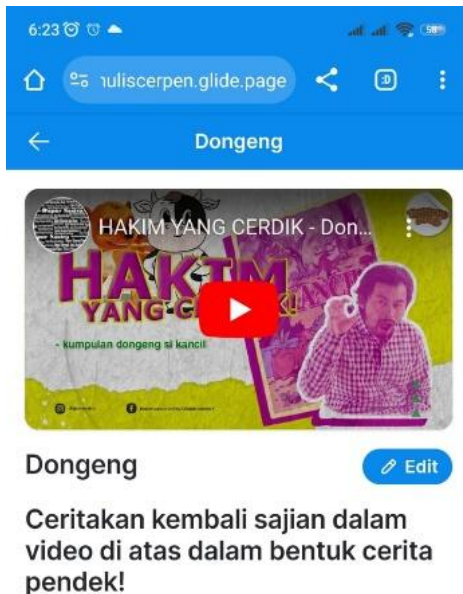
Figure 3 of the in-app video display