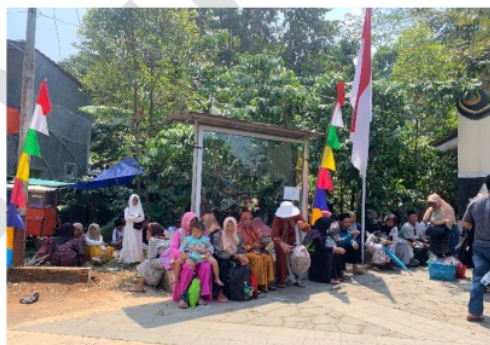
Picture 2. Cross-Age Pilgrims