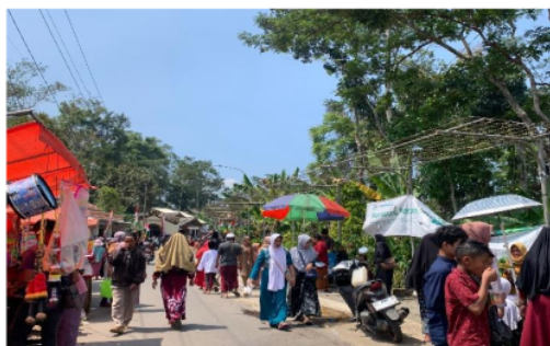
Picture 1. Walking Pilgrims

In Picture 1, pilgrims who come on foot make the first procession to Kwarasan spring. Pilgrims of all ages, adults, teenagers and children together purify themselves in the spring. This has become one of the traditional processions of the Muneng pilgrimage.