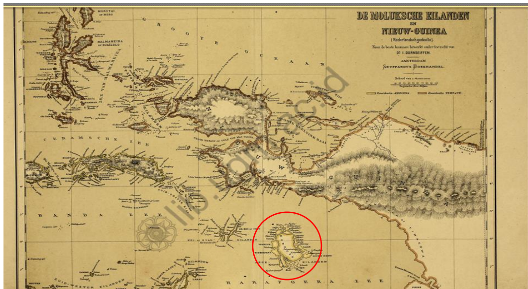
Figure 1: Map from Atlas van Nederlandsch: Oost- en West-Indie