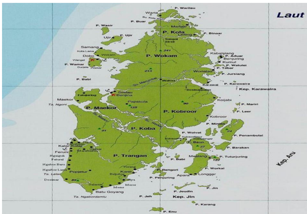
Figure 2: Map from Aru Islands.blogspot.com

Looking at its geographical location, the frontshore area is a stepping stone for anyone intending to enter and exit Aru Islands from the west side. In the 17 th century, Ujir Island was a significantly lively area, particularly with trade activities. The travel log of a VOC ( Vereenigde Oost Indische Compagnie – Dutch East Indies Company) leader called Adriaan Dortsman and priest Jacobus Vertrecht in 1646 states that sailing ships from Malay, Makassar, and Java had already been engaging in trade activities in the island of Ujir. Aside from bringing in commodities from their