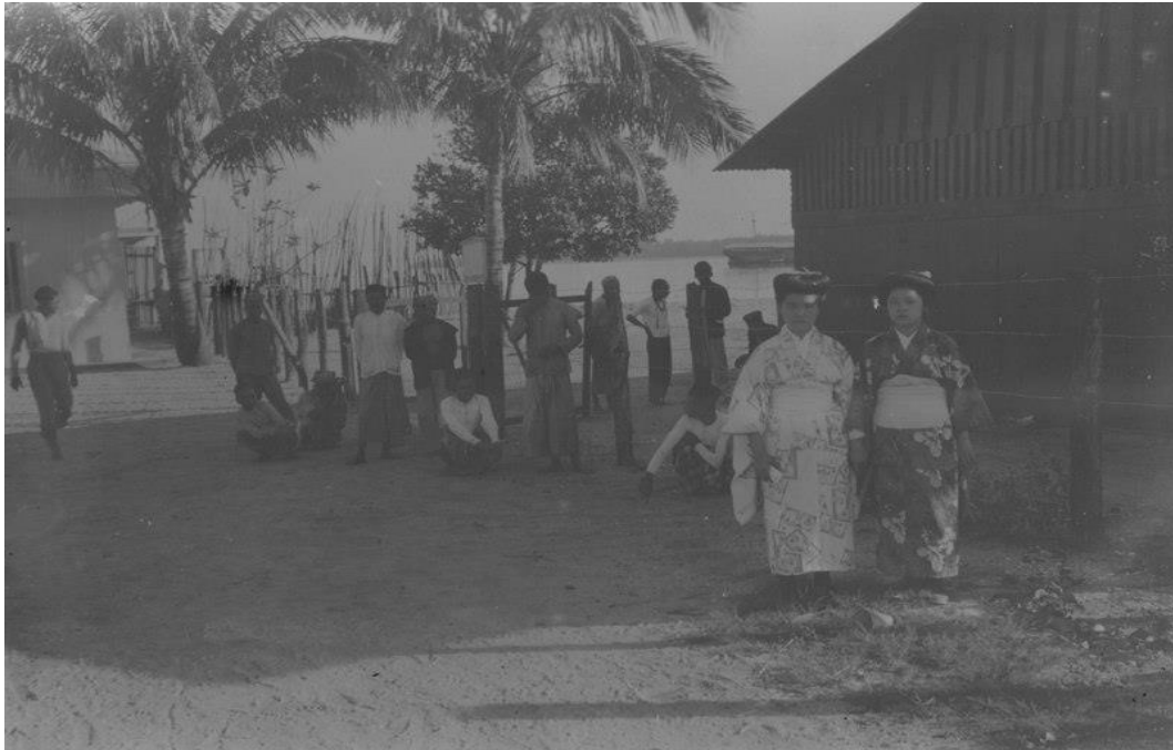
Figure 5: Doka port in Trangan Island, one of the regions in the Aru Islands.

government in Tokyo. Their presence abroad is temporary. Whether Tokyo beckons them home, they should comply. Such propaganda was duly complied with by the immigrants. Two days before the announcement of the Pacific War, most of the immigrants were summoned back home to Japan.