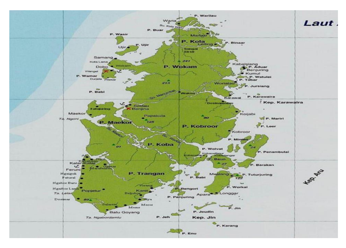
Figure 2: Map from Aru Islands.blogspot.com

Looking at its geographical location, the frontshore area is a skipping stone for anyone intending to enter and exit Aru Islands from the west side. In the 17<sup>th</sup> century, Ujir Island was a significantly lively area, particularly with trade activities. The travel log of a VOC ( Vereenigde Oost Indische Compagnie – Dutch East Indies Company) leader called Adriaan Dortsman and priest Jacobus Vertrecht in 1646 states that sailing ships from Malay, Makassar, and Java had already been engaging in trade activities in the island of Ujir. Aside from bringing in commodities from their