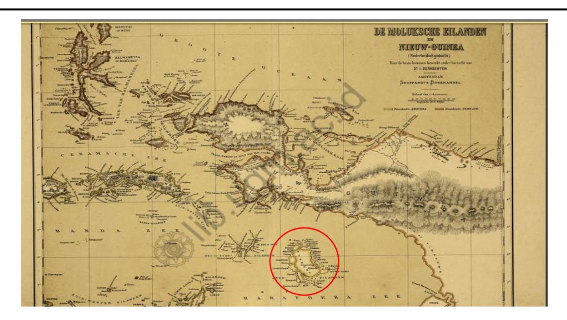
Figure 1: Map from Atlas van Nederlandsch: Oost- en West-Indie