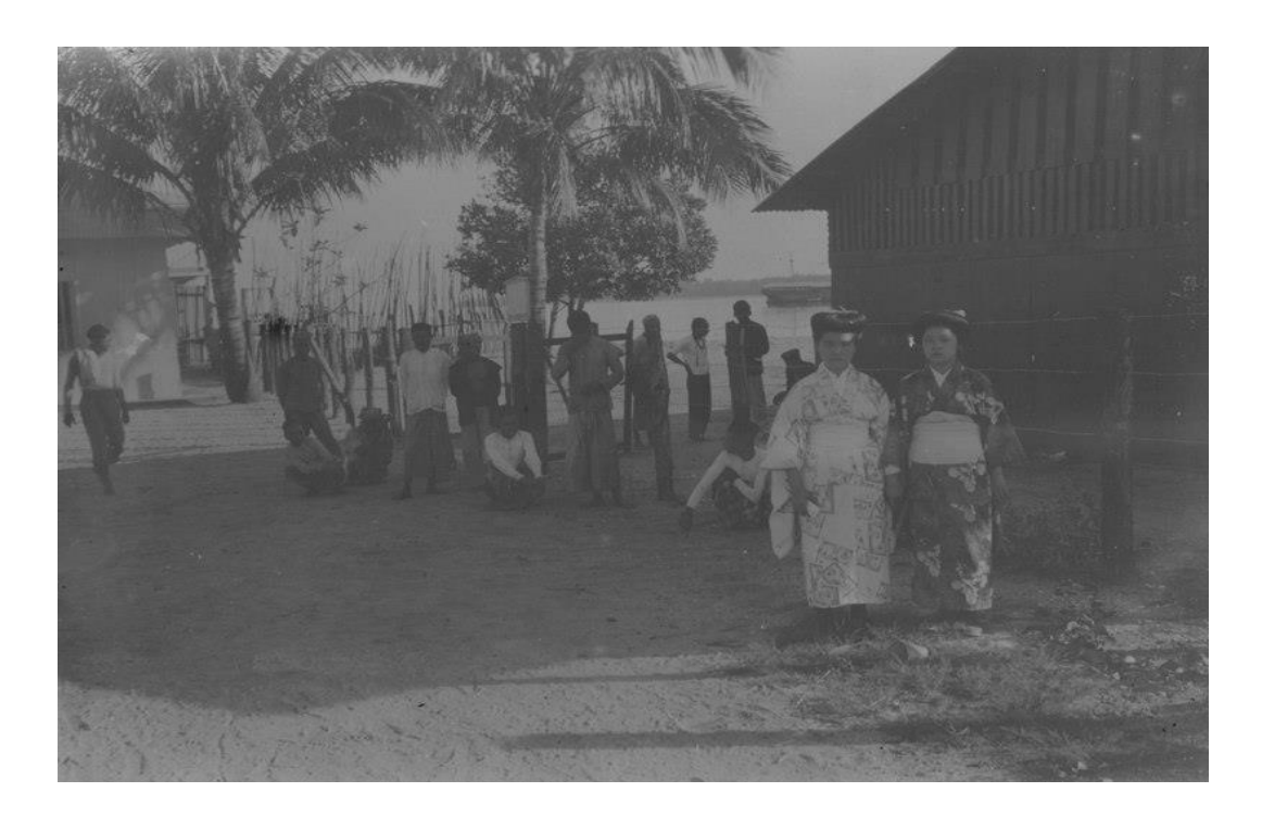
Figure 5: Doka port in Trangan Island, one of the regions in the Aru Islands. On the right-hand side, two women are seen wearing a kimono.

government in Tokyo. Their presence abroad is temporary. Whether Tokyo beckons them home, they should comply. Such propaganda was duly complied with by the immigrants. Two days before the announcement of the Pacific War, most of the immigrants were summoned back home to Japan.