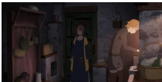
Figure 5. Ariel comes home to his wife

to form meaningful connections beyond family and romantic ties. These relationships illustrate Ariel's growing capacity for trust and emotional intimacy, showing how his experiences have shaped him into someone who values the support and understanding of those around him. Through both his marriage and his friendships, Ariel learns the significance of building relationships that are based on mutual respect, shared experiences, and emotional closeness.