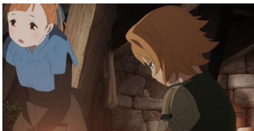
Figure 3. Ariel feels inferior to Lang [Source: Okada, Mari. 2018]

For the character Ariel, there is no available data for this stage due to a time skip between the ages of 6 and 17-18. However, based on the conversation between Maquia and Lang, they lived a transient lifestyle because Maquia, as an orph, was constantly on the move, fleeing from Mezarte Kingdom's pursuit. As a result, Ariel was unable to devote his energy to acquiring knowledge and intellectual growth in a stable school environment due to the difficult and unstable conditions of their wandering lifestyle.