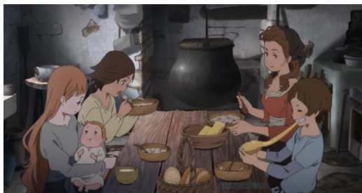
Figure 1. Ariel was feeded by Maquia

The first stage occurs between the ages of 0 to 12 months. Ariel's basic needs were met from the moment she was rescued by Maquia. These basic needs, such as clothing, food, and shelter, were fulfilled during the early stages of development. This fulfills made Ariel trust the person who raised him right.