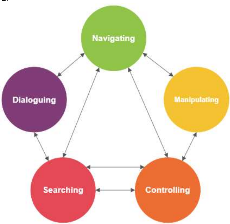
Figure 2. Relationships Between Digital Book Features

A digital book itself is an electronic book that has elements of written text, images and graphics (motion graphics). A digital book must have five features which are reflected in the following Figure 2.