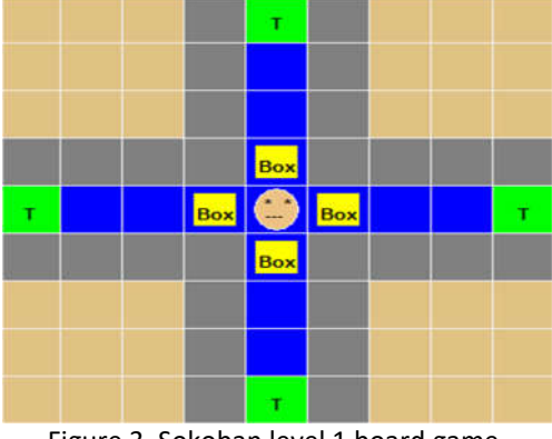
Figure 3. Sokoban level 1 board game.

A* algorithm is implemented in the sokoban game application which is used to find the shortest path of the player in pushing boxes to the target. The first step is to look for nodes around the current node and then we all fit into an array. Once accommodated, we calculate the value of F for each node in the array and we select the node that has the smallest F value as the best node. Then we move the current node to the best node. Do this repeatedly until the current node value is the same as the target node value. consider the following figure 3 :