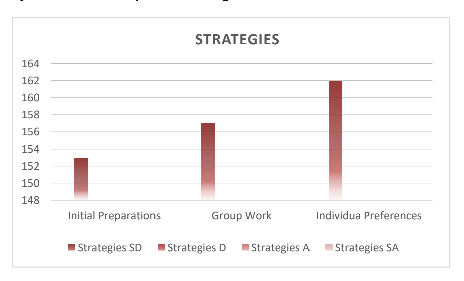
Figure 2 Strategies Used by the Students

remain silent during the sessions. Furthermore, close results are shown in the Group Work and Initial Preparations . A total of 157 and 153 respondents responded agreed and strongly agreed on the strategies. They required additional time to prepare topics for their performances. The preparations are varied between one another. Sometimes they spend a lot of time searching some references on the internet and learning pronunciation practice both individually and within groups. The strategies used by the students are pictured in Figure 2.