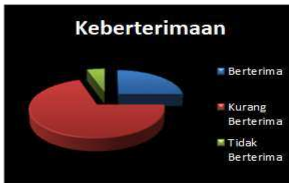
Diagram 2. Acceptability

On the quality of translation in terms of acceptance, the processed data shows that the level of acceptance is dominated by less acceptable with a percentage of 70% compared to the level of acceptance. In the example above, translating the source language into the target language does not meet the grammatical rules or the equivalent that fits the reader's ears, resulting in a higher level of unacceptability. The message he conveys is also less flexible and sounds foreign to the ear.