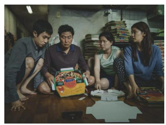
Figure 2. The condition of The Kim's house in scene 00:01:34 – 00:06:50

Bong Joon-Ho through the Parasite film illustrates that life is not always black and white, and wrong and right. However, sometimes life is grey. In the Parasite film, it is described that humans have decisions that can affect their destiny at any time. As seen in the film, The Kim's cannot simply be labelled as evil underclassmen. In the film, it is still told how The Kim's continues to behave well with The Park's and carry out all their duties properly. There is a dialogue between The Kim's and The Park's implies that the wealthy upper class is charitable and eager to help since they are rich (Ikhsan, 2022).