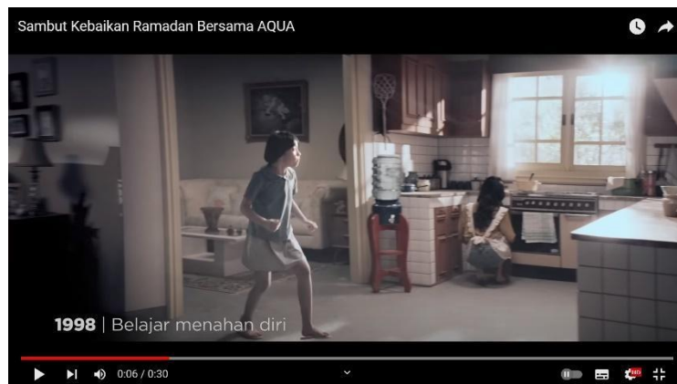
Figure 2. Showing a young girl running slowly at 0.06 seconds.

Thus, the connotative interpretation in this advertisement reveals the meaning of customer loyalty through the consistent use of AQUA products amidst the changes and variations of Ramadhan. Researchers associate the first scene, the time setting, the use of the AQUA brand at the dinner table, and the narrative sentences to illustrate the loyalty between customers and the AQUA brand.