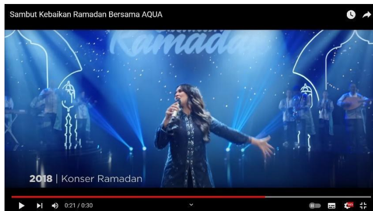
Figure 4. The woman conducting a concert amid Ramadhan at 0.21 seconds

achievement. Since the strength of this ad is the storytelling of a girl, the picture of loyalty can be seen from the changing growth of the girl.