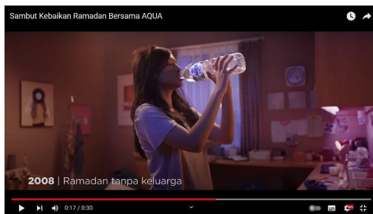
Figure 3. An adolescent girl awakens when her alarm goes off and drinks AQUA water immediately at 0.17 seconds.

In the next scene (see Figure 5), there is a scene depicting a teenage girl who wakes up when the alarm goes off. She looks hurried and immediately takes drinking water from AQUA-branded containers. The narrative that appears in this scene is "Until the moment I live it alone". This scene can mean that the teenager has reached a stage of development where she has responsibility for herself, including maintaining health and choosing the right drinking water, such as AQUA. This illustrates the concept of independence and individual growth, which is the value to be conveyed in this advertisement.