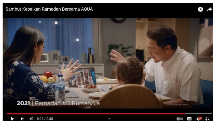
Figure 5. A little family is gathered around the dinner table at 0.26 seconds

In this scene, the denotative meaning is a woman holding a concert in Ramadhan's atmosphere. Her facial expression shows happiness and excitement. The dominant blue color and white silhouette depict a festive and enthusiastic atmosphere. The narration "Until colorful" suggests that this concert is a moment that enlivens and gives color to life. The concert, which was held in the atmosphere of Ramadhan, reflected the spirit and joy of worship in the holy month. The concert symbolizes the changing growth and development of girls in their lives. By portraying this change through the woman who organized the concert, the ad wants to show the loyalty that develops over time. Through the story's exposure and the changes in the girl's growth, this ad wants to portray that AQUA has become an integral part of the woman's life and journey, thus creating a strong sense of loyalty.