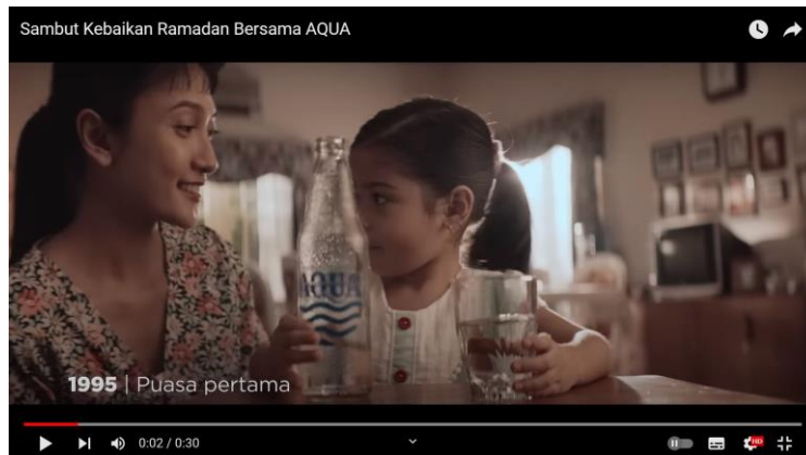
Figure 1. The first scene shows a small girl pouring mineral water with her mom at 00.02 seconds

Connotation describes the interaction that occurs when a sign meets the feelings or emotions of the reader and their cultural values. Connotation has a subjective meaning; in other words, it is how a sign is described (Sulistyarini & Gustina Zainal, 2020). In each scene, the narration that begins seems to explain to the audience the development of a person's growth and loyalty to the brand. The musical instruments in this advertisement use guitar sounds that make the atmosphere warmer and more family-like.