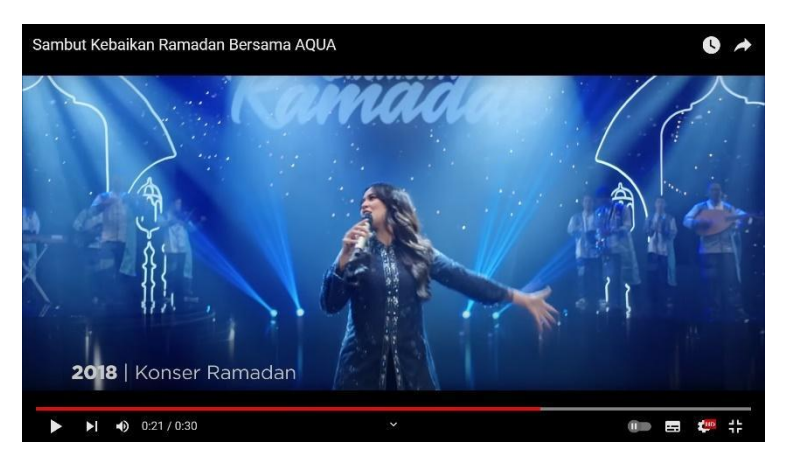
Figure 4. The woman conducting a concert amid Ramadhan at 0.21 seconds

achievement. Since the strength of this ad is the storytelling of a girl, the picture of loyalty can be seen from the changing growth of the girl.