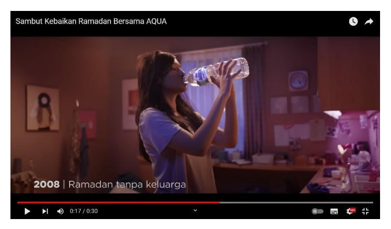
Figure 3. An adolescent girl awakens when her alarm goes off and drinks AQUA water immediately at 0.17 seconds.

In the next scene (see Figure 5), there is a scene depicting a teenage girl who wakes up when the alarm goes off. She looks hurried and immediately takes drinking water from AQUA-branded containers. The narrative that appears in this scene is "Until the moment I live it alone". This scene can mean that the teenager has reached a stage of development where she has responsibility for herself, including maintaining health and choosing the right drinking water, such as AQUA. This illustrates the concept of independence and individual growth, which is the value to be conveyed in this advertisement.