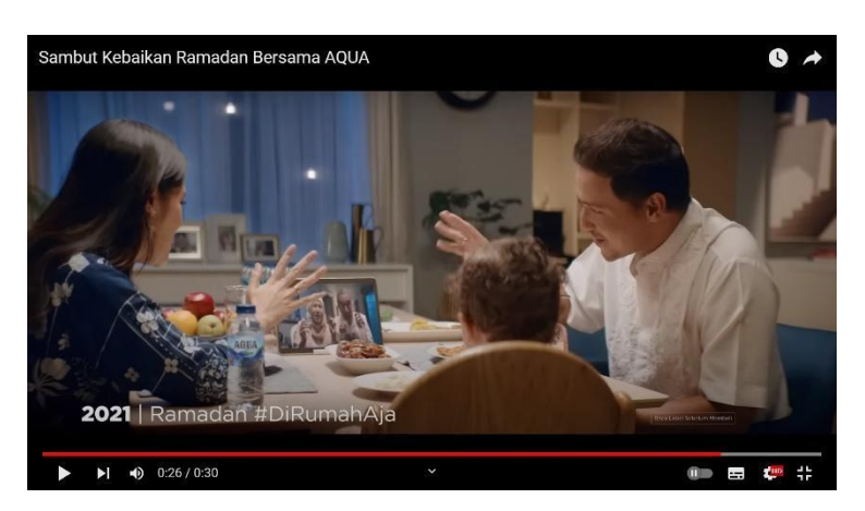
Figure 5. A little family is gathered around the dinner table at 0.26 seconds

In this scene, the denotative meaning is a woman holding a concert in Ramadhan's atmosphere. Her facial expression shows happiness and excitement. The dominant blue color and white silhouette depict a festive and enthusiastic atmosphere. The narration "Until colorful" suggests that this concert is a moment that enlivens and gives color to life. The concert, which was held in the atmosphere of Ramadhan, reflected the spirit and joy of worship in the holy month. The concert symbolizes the changing growth and development of girls in their lives. By portraying this change through the woman who organized the concert, the ad wants to show the loyalty that develops over time. Through the story's exposure and the changes in the girl's growth, this ad wants to portray that AQUA has become an integral part of the woman's life and journey, thus creating a strong sense of loyalty.