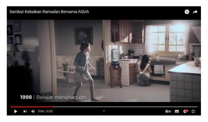
Figure 2. Showing a young girl running slowly at 0.06 seconds.

Thus, the connotative interpretation in this advertisement reveals the meaning of customer loyalty through the consistent use of AQUA products amidst the changes and variations of Ramadhan. Researchers associate the first scene, the time setting, the use of the AQUA brand at the dinner table, and the narrative sentences to illustrate the loyalty between customers and the AQUA brand.