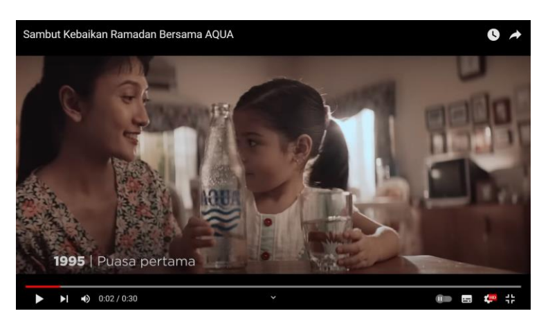
Figure 1. The first scene shows a small girl pouring mineral water with her mom at 00.02 seconds

Connotation describes the interaction that occurs when a sign meets the feelings or emotions of the reader and their cultural values. Connotation has a subjective meaning; in other words, it is how a sign is described (Sulistyarini & Gustina Zainal, 2020). In each scene, the narration that begins seems to explain to the audience the development of a person's growth and loyalty to the brand. The musical instruments in this advertisement use guitar sounds that make the atmosphere warmer and more family-like.