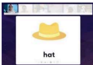
Figure 2 Example of Flashcards Used in Nana's Class

Second, despite the participants' claim on how effective phonics was for teaching early reading skills to their students, they did not use phonics as the only approach in class. Instead, they complemented it with other reading approaches, namely, whole language and read aloud. They also incorporated a variety of resources to support their phonics instruction, including PowerPoint slides, flashcards, the ABC song, practice books, and homework books. Even Adrian and Nana were seen using decodable texts in their lessons.