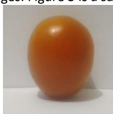
Figure 3. Sample Tomato Image after preprocessing

At this stage, the image data to be classified is done by cropping and resizing to a size of 100 x 100 pixels, with the aim to normalize the image and speed up the computation process at the training and testing stages. Figure 3 is a sample of preprocessing images.