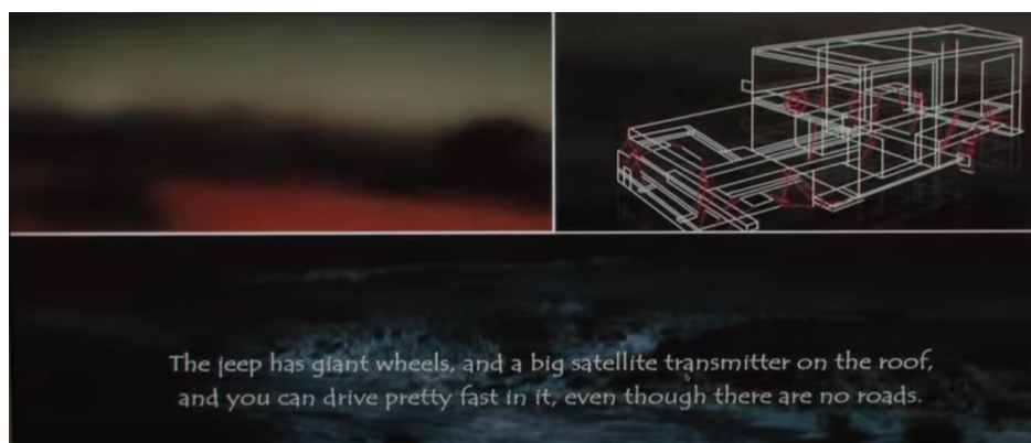
Figure 1 The Example of Electronic Literature

Cyber literature also has other similar terms such as “digital literary” (Hoover et al. 2014) and “electronic literature” (Hayles, 2008; Zalbidea and Sotelo, 2014). Unlike Viires, Hayles (2001) does not consider the digitized print literature as a part of electronic literature. She claims that electronic literature is “digital-born” and is intended to be composed, shared, and read on a computer. Hayles points out that the fundamental difference between electronic literature from print literature is “it [electronic literature] cannot be accessed until it is performed by properly executed code.” Nugraha & Suyitno (2020) assert that electronic literature is not just a different medium between cyber literature and traditional literature; electronic literature is intended to be enjoyed and read on a computer screen. It can lose its aesthetical feature if it is printed.